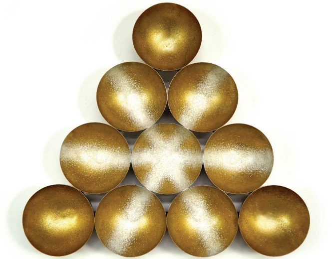
TO LOVE AND TO BE LOVED

The spherical form of the stainless steel vessels is emphasised through Ho’s physical application of paint to their surfaces. The pointilistic painting techniques to create highly detailed and patterned works that are a unique blend of abstraction and representational motifs. For Ho, the use of dots is a physical representation of ‘energy’ in its simplest and purest forms. Their application to surface is almost three-dimensional, as the convergence of dots suggests a sense of rhythm and movement. Working with a muted colour palette of gold and silver tones, the resulting surfaces suggest potential links to alchemy. Ho’s earlier works used hand-beading and textile techniques, and this meticulous attention to detail and process is evident in this body of work through Ho’s painterly application. Against the darkened base layer of the bowls as containers, the paint appears to radiate from its depths creating a sense of depth, time and space.