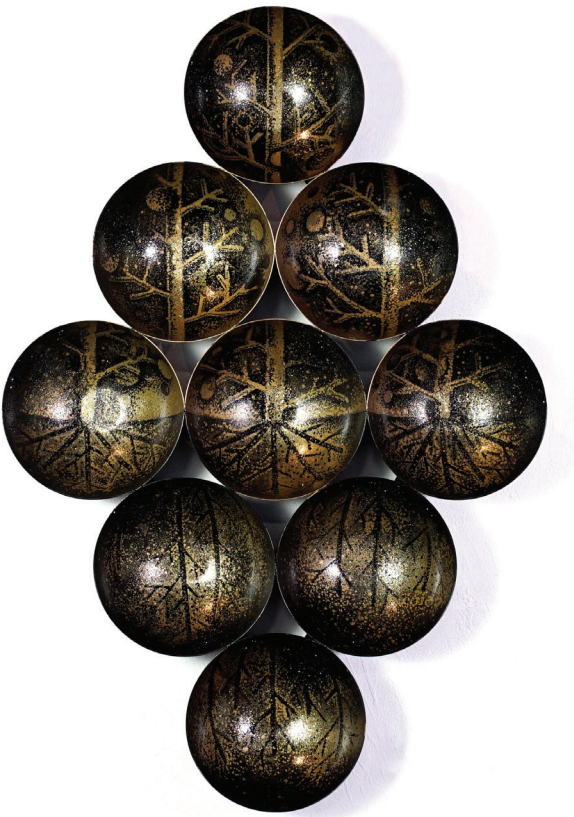
AS ABOVE, AS BELOW, AS WITHIN

The significance of the circle as a basis for all structures of life, from biological cells to planetary forms, is harnessed by Ho as a means to draw on the correlations between nature and human systems. As Above, As Below, As Within can be read visually as either tree branches and root systems, or perhaps the internal structure of the human lungs. In either case, lungs and branches have the same function delivering essential components of life through a guided channel. By conflating the two and demonstrating the similarities, Ho is prompting us to reconsider our human position in the natural world, a relationship that is not wholly single-sided but much rather co-operative.